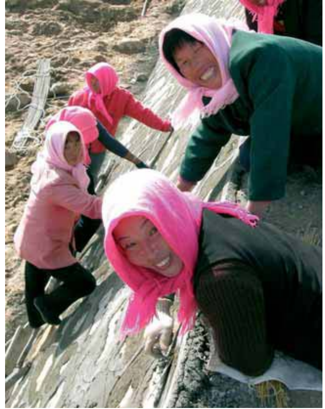
The working women peasants © WANG GUANGZHUANG