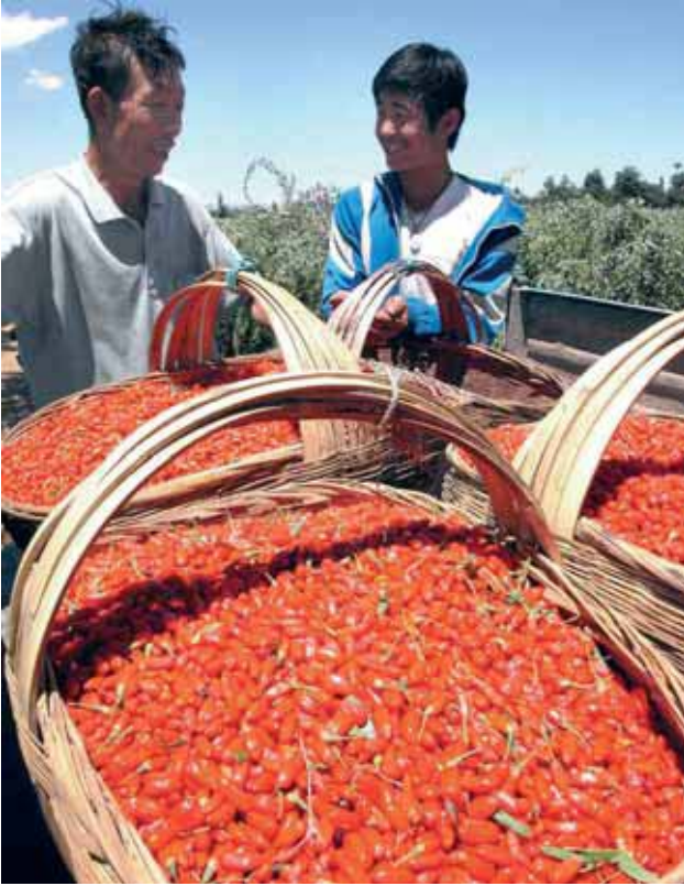
By the harvest of Lycium chinense (fruit of Chinese wolfberry)