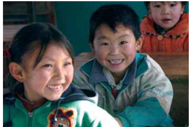
The children of peasants are ready to go to the class.