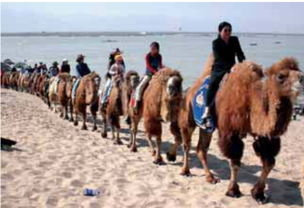
Sightseeing in the Shahu sceney zone, a famous ecological tourismus zone